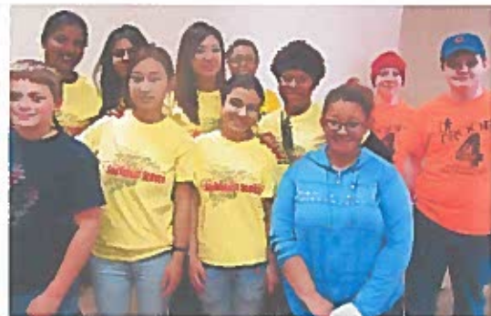
Many thanks to our volunteers from SEMO University and our own Boy Scout Troop 4. Both groups were wonderful help!

The Mission Committee is proud to announce that the Rummage Sale made $3,357. This will be distributed to both the Amen Center in Delta and HOPE House in Jackson. Mission is so grateful for the response from the congregation. The donations and volunteer help far surpassed our expectations. It was three days of long hours, hard work and lots of fellowship and fun. Thank you!