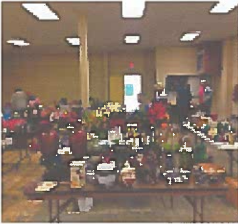
Looking for a treasure? Thanks to donations from the congregation, there were two large rooms overflowing with goodies!