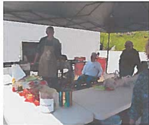
Hungry? Hamburgers and hotdogs were prepared by our own Presbyterian barbeque team. Delicious!!!